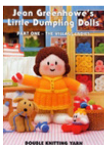
Little Dumpling Ladies