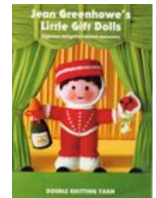
Little Gift Dolls