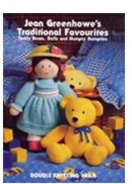
Christmas Special Traditional Favourites