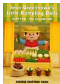
Little Dumpling Men