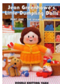
Little Dumpling Ladies