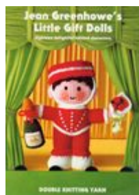
Little Gift Dolls